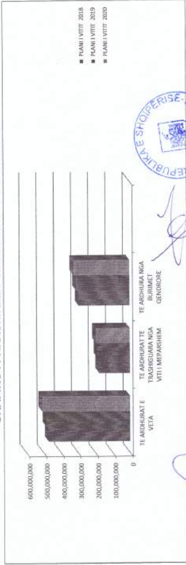
GRAFIKU I PARASHIKIMIT TE TE ARDHURAVE 2018-2020