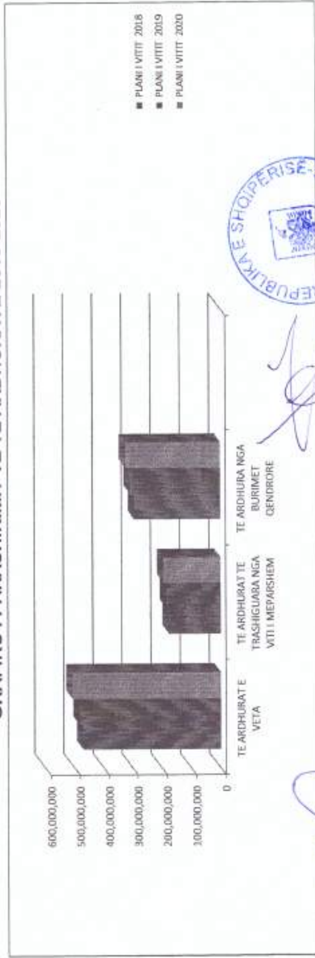
GRAFIKU I PARASHIKIMIT TE TE ARDHURAVE 2018-2020